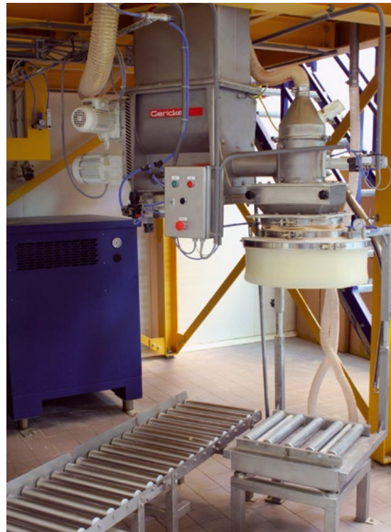
GDU 451 feeder with weighing platform and roll conveyor is filling the drums and boxes.

For more information on our other products, services, distributors see: www.gericke.net