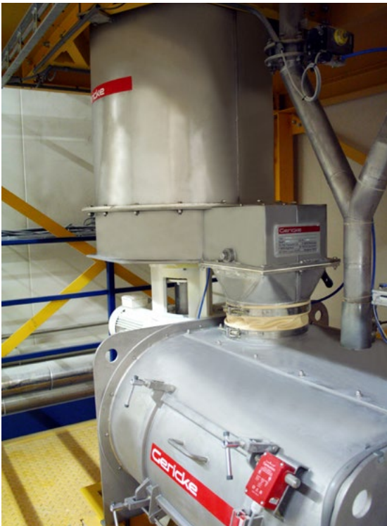
RA Bin Discharger feeding yolk to mixer.