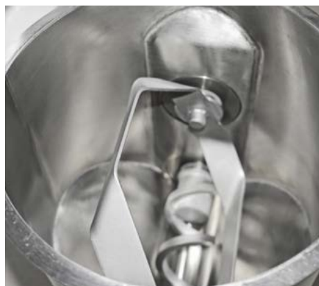
Feeding chamber with intramitter