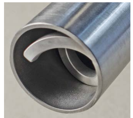
Feeding tool - helix