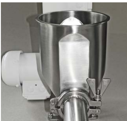
Feeding tube Tri-Clamp connection