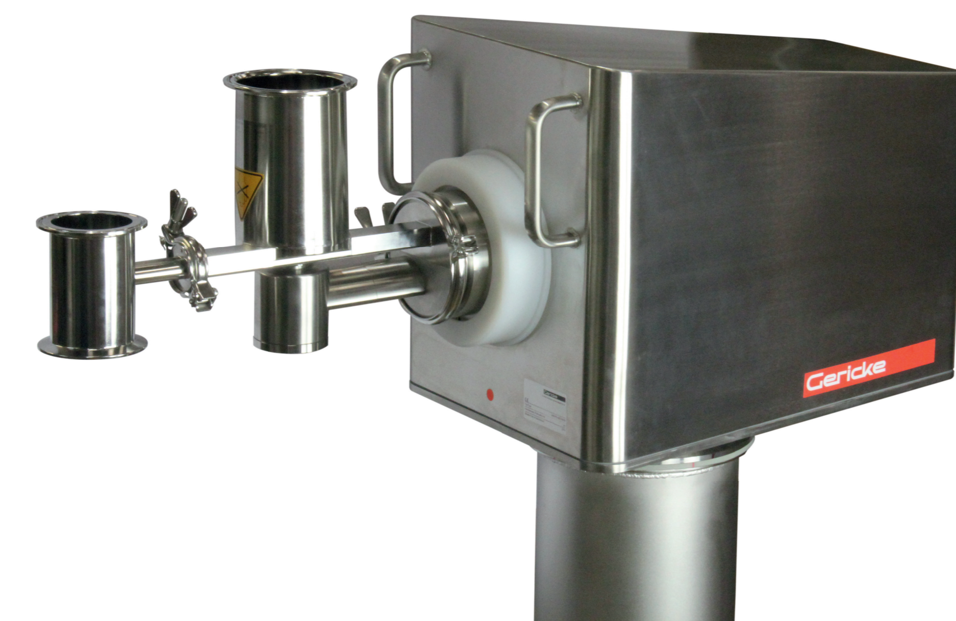
Fig 1: Experimental setup using a gravimetric loss in weight feeder (Gericke).

The discharged excipients were collected in a bin placed on a Mettler Toledo weight scale. Weight measurements were taken every 1 s and the data was analyzed by a software developed by Gericke using LabView.