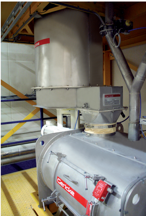
RA Bin Discharger feeding yolk to mixer.