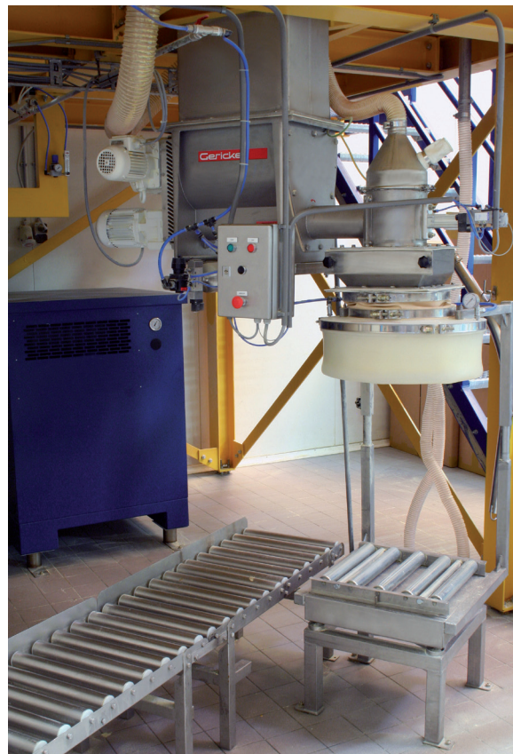
GDU 451 feeder with weighing platform and roll conveyor is filling the drums and boxes.