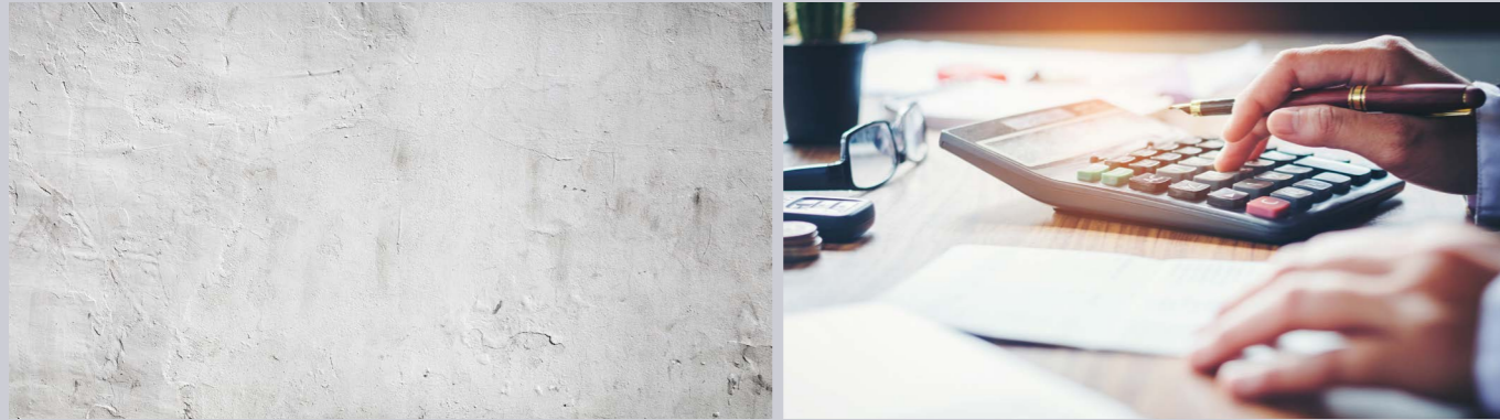
Precise dosing and automated processes increase product quality.

The key to product quality is, above all, sufficiently accurate metering of the components and homogeneous mixing.