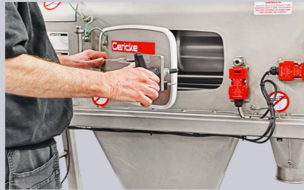
Lump breakers and screening machines homogenise the bulk material and remove foreign bodies.