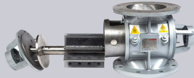
Abrasion caused by pigments in a rotary valve. Heavy-duty and modular rotary valves simplify maintenance in such plants.