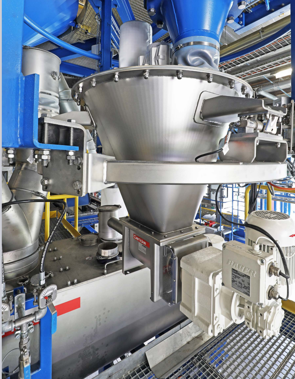
Installation in a construction chemical plant (continuous mixing process).